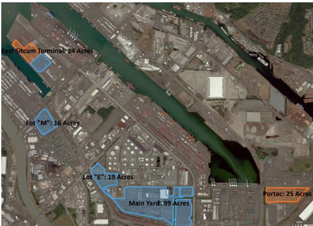
Blue: AWC Base Acres Orange: Incremental Acres for GLOVIS/KIA